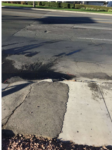
VAN BUREN BLVD