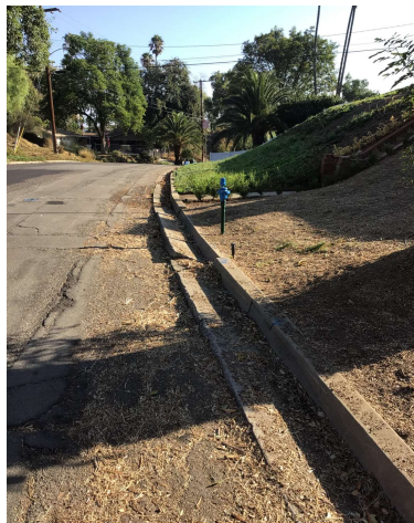
WESTERN HILLS DR