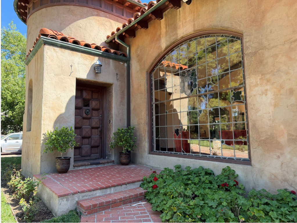
Figure 5 - Main entry, view looking north