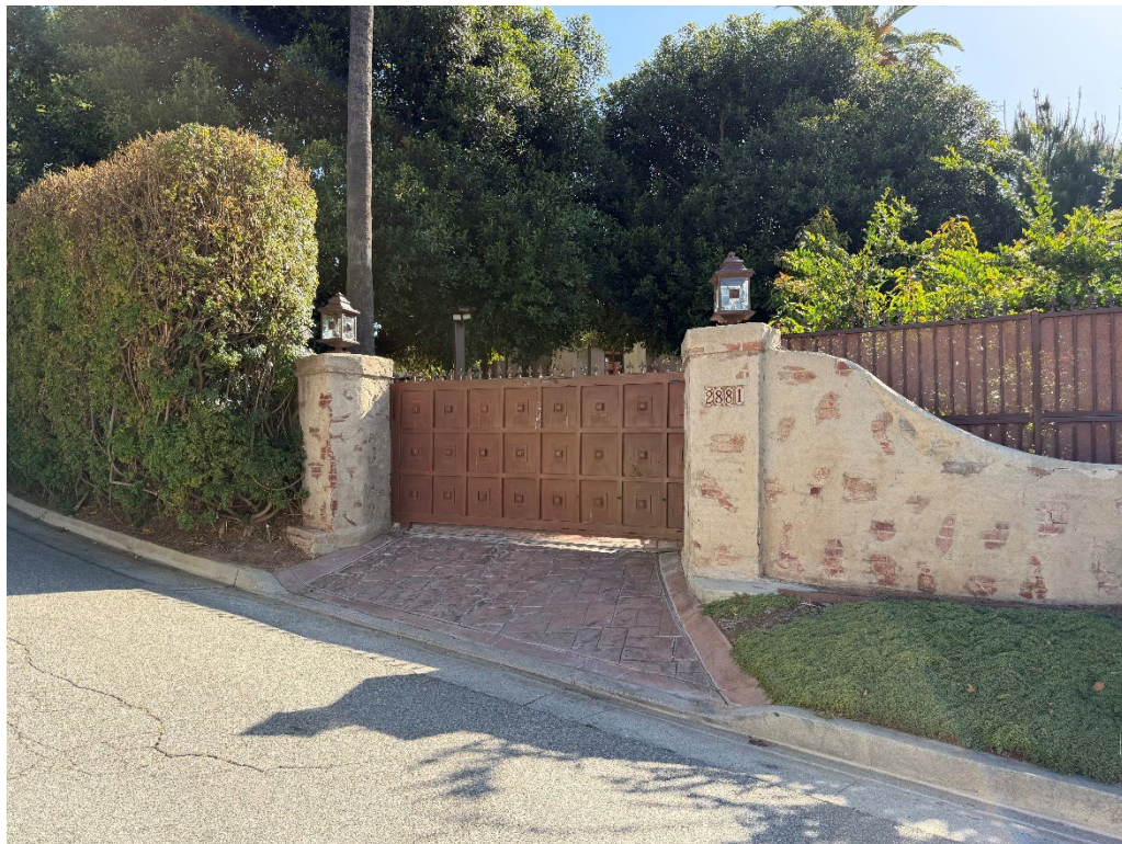
Figure 8 - Perimeter wall at south gate, view looking east