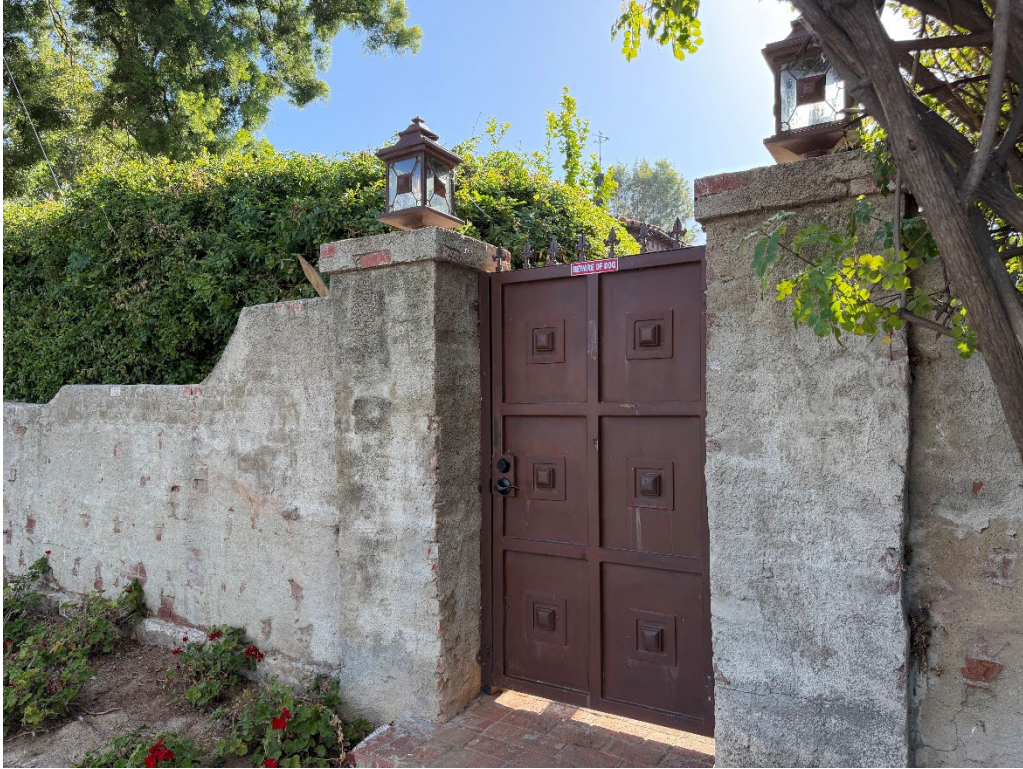
Figure 7 - Perimeter wall with pedestrian gate, view looking west