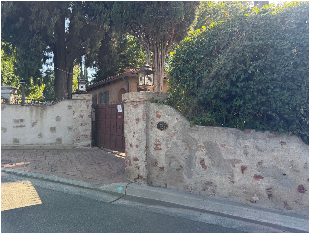
Figure 6 - Perimeter wall at north gate with gate house, view looking north