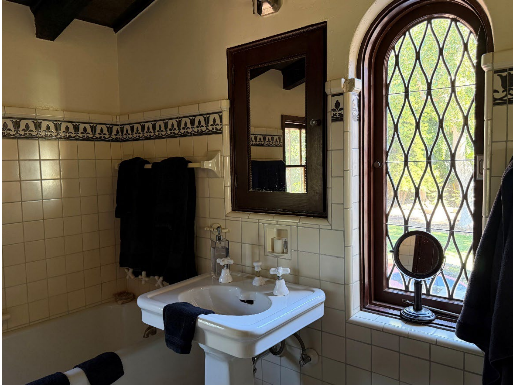
Figure 11 - Master Bathroom with original tile and fixtures