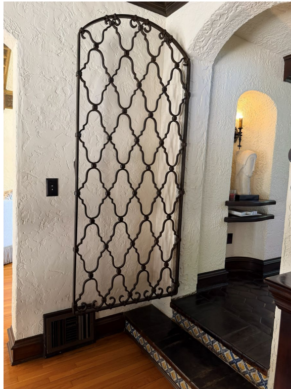
Figure 10 - Example of interior iron work