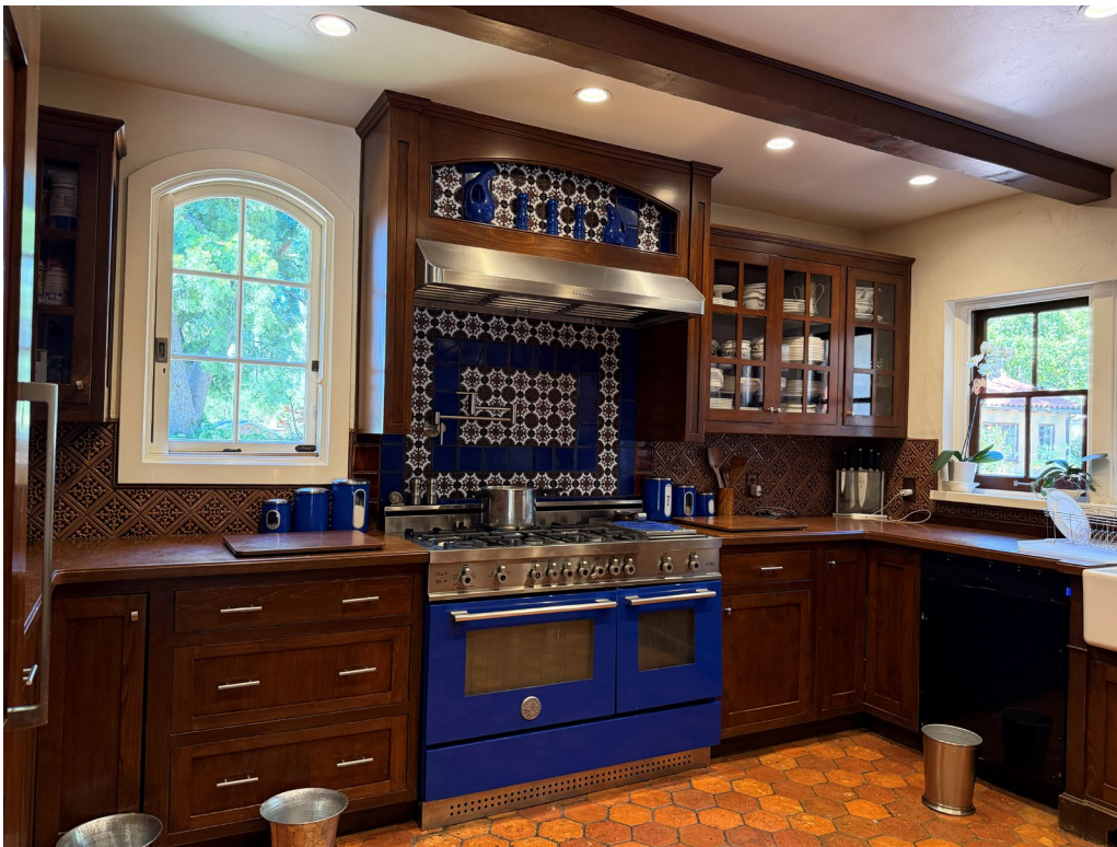
Figure 14 - Non-original kitchen