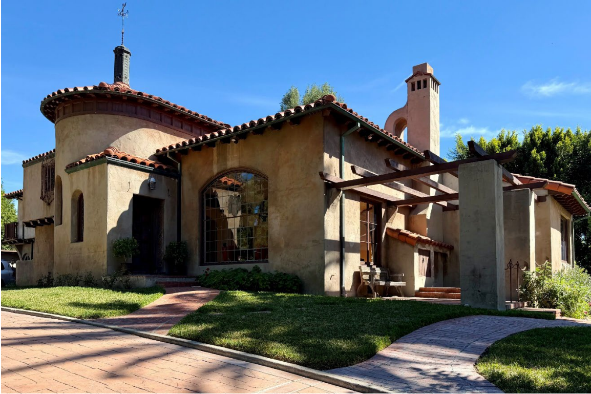
Figure 1 - Primary facade (west elevation), view looking northeast