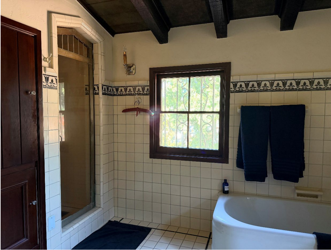
Figure 13 - Master Bathroom with original tile and fixtures