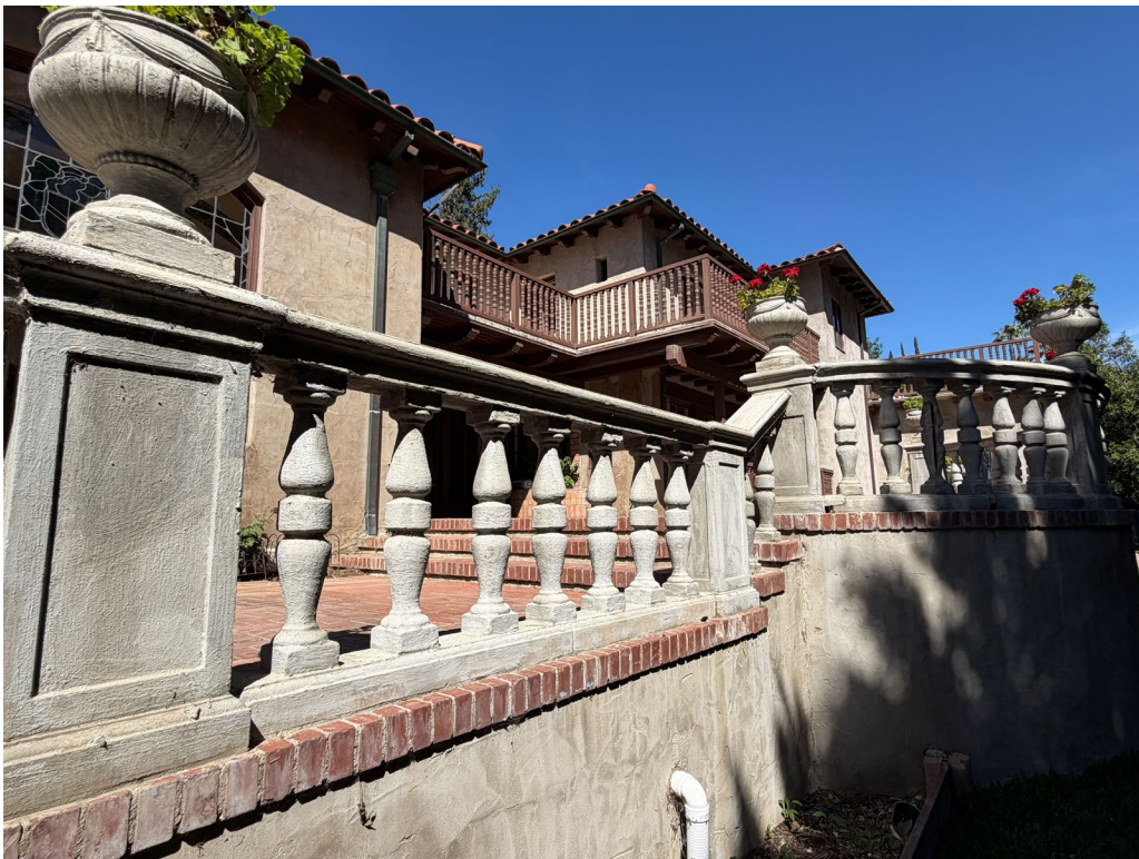
Figure 4 - Rear patio balustrade, view looking north