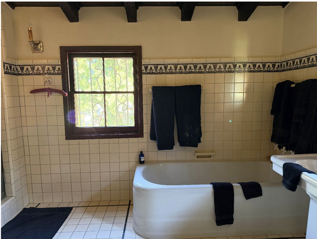
Figure 12 - Master Bathroom with original tile and fixtures