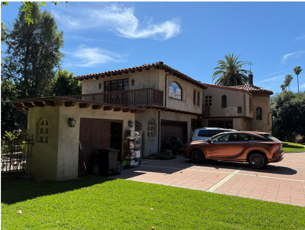
Figure 2 - West elevation, view looking southeast