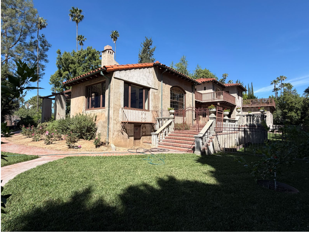
Figure 3 - Rear (east) elevation, view looking northwest