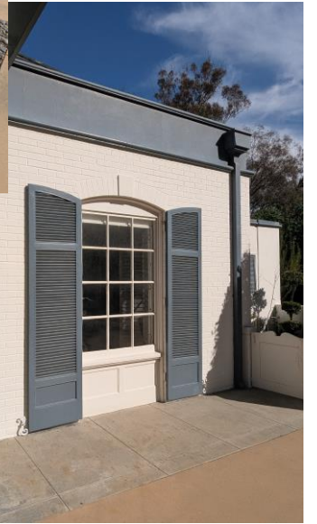
Hollywood Regency Decorative Features