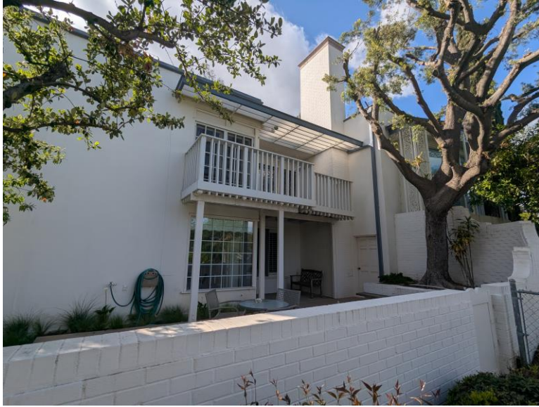
East (rear) Elevation