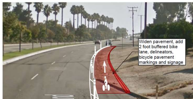
VAN BUREN BOULEVARD, WEST OF GLESS RANCH, LOOKING EASTBOUND