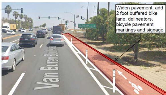
VAN BUREN BOULEVARD, EAST OF GLESS RANCH, LOOKING EASTBOUND