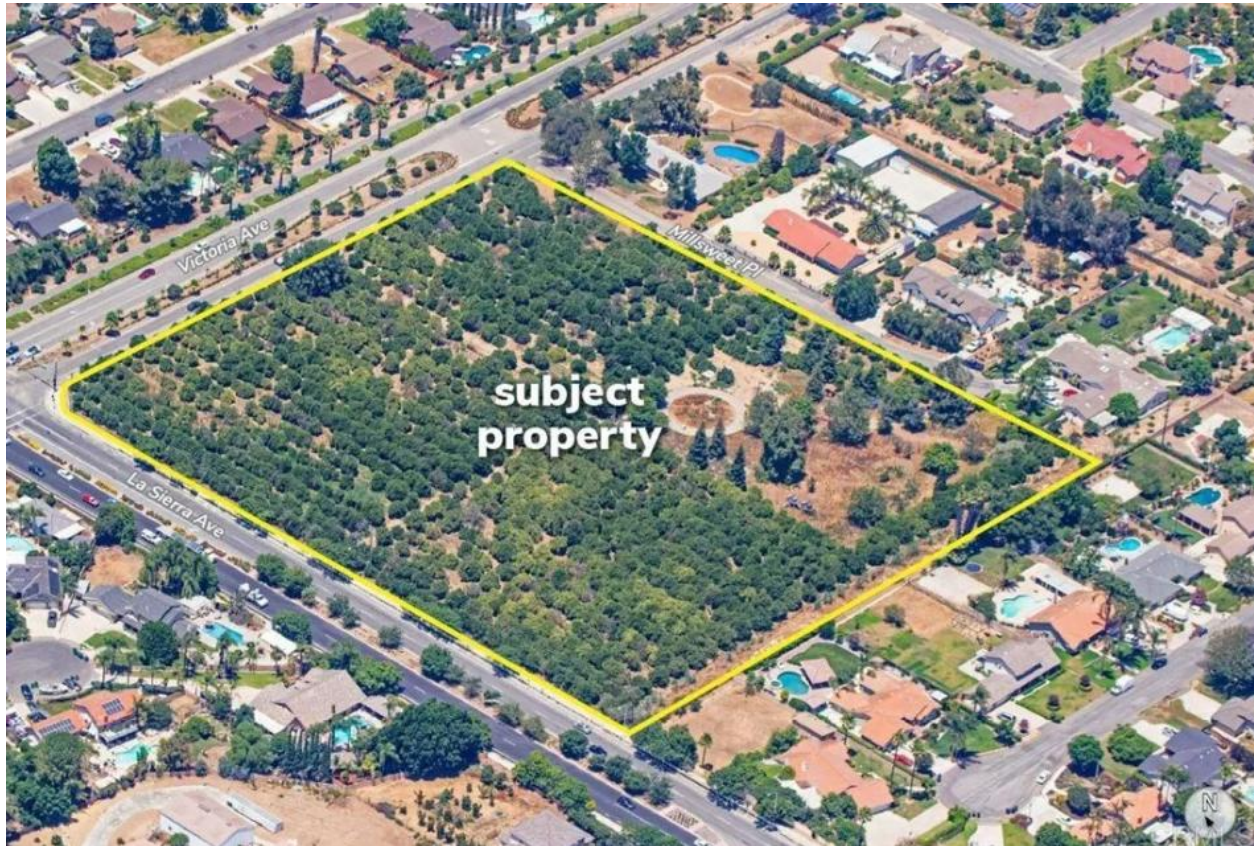
Figure 1: Aerial Photograph of Project Site

ails Master Plan and the Victoria Avenue Ad Hoc Committee Design and Development Standards for Victoria Avenue.