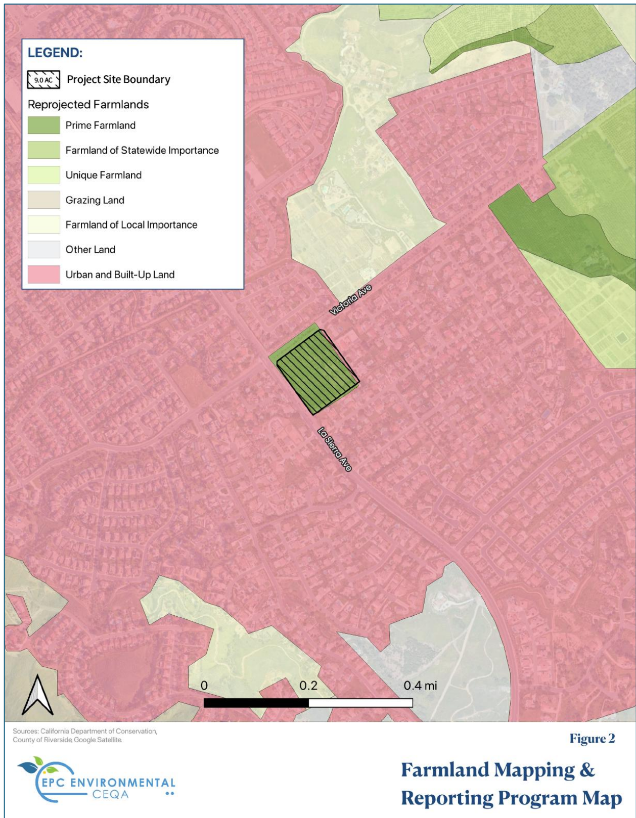
Figure 2: Important Farmland