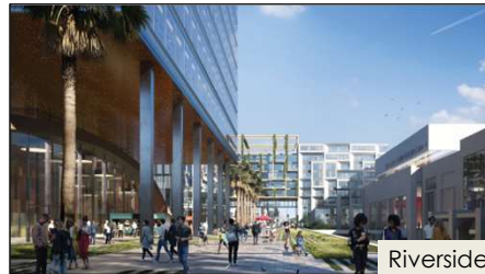
Riverside Alive EIR