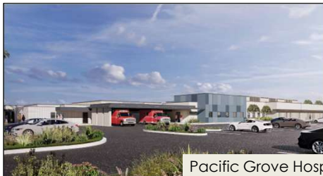
Pacific Grove Hospital