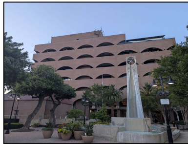
Riverside City Hall