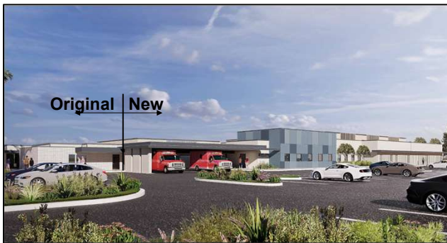
Pacific Grove Hospital Expansion