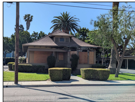
4472 Orange St – Fire Damage Structure Demo