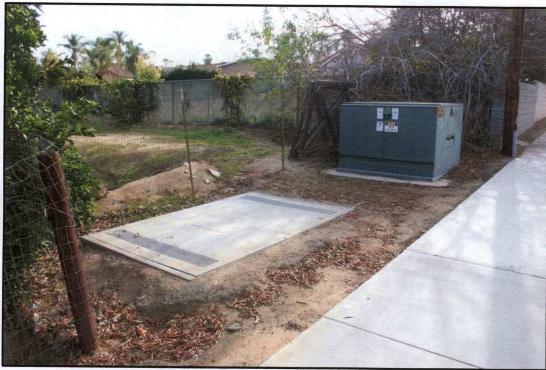
Southern corner of subject property is indented to allow for electrical facilities (East)