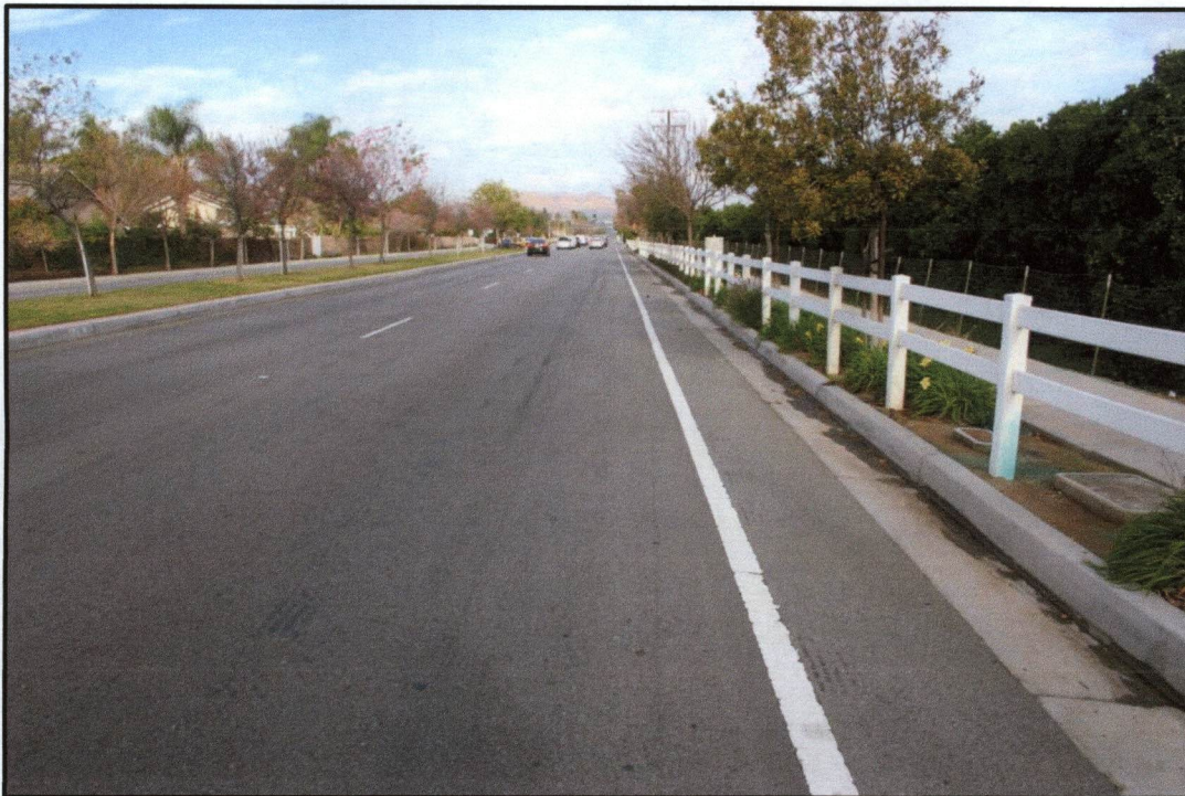
La Sierra Avenue corridor from southern corner of the project area (subject property on right; Northwest)