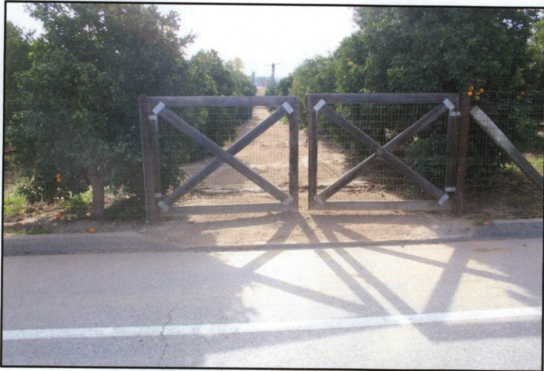
Utility gate to subject property on Victoria Ave (locked); note wind propeller in background (Southeast)