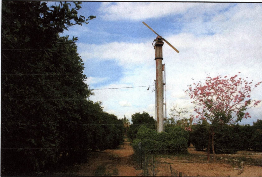
Solitary wind machine near center of property (Northwest)