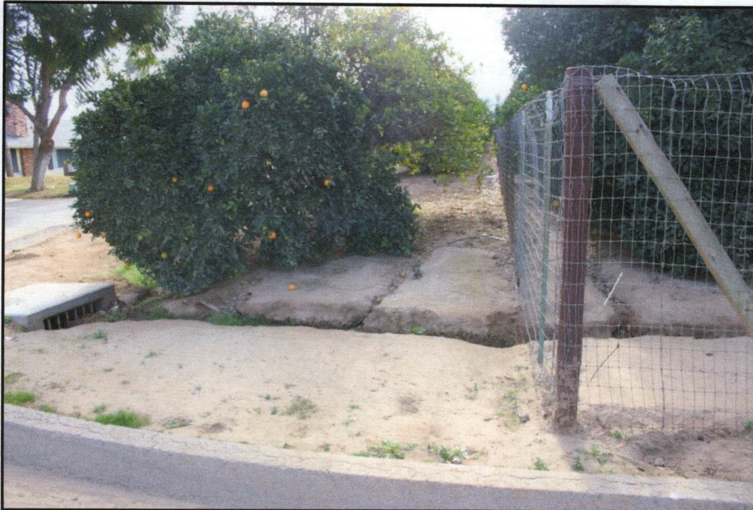
Subject property fence line parallel to Millsweet (Southeast)