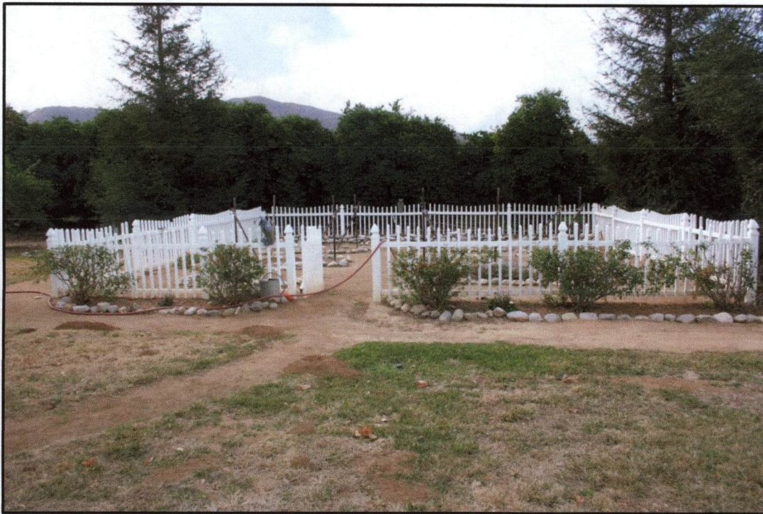
Solitary wind machine near center of property (Northwest)