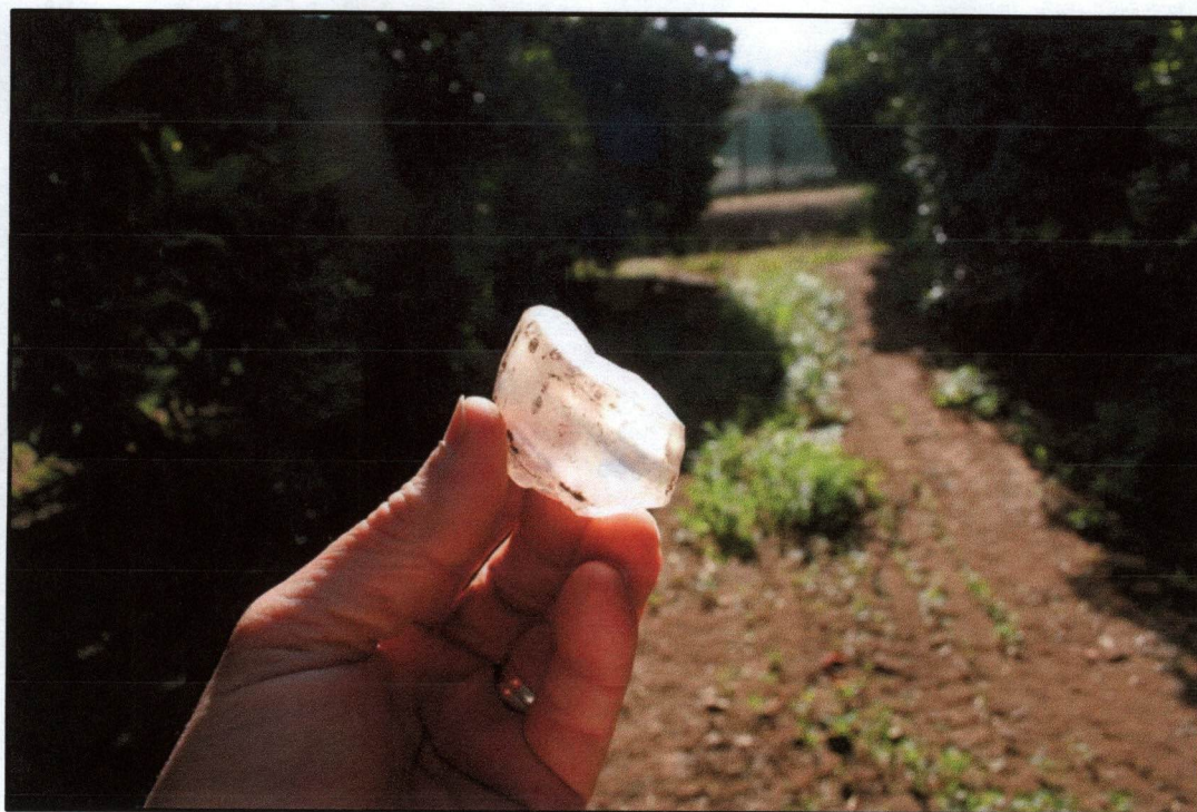
Non-stippled bottle base fragment in orchard (Detail)