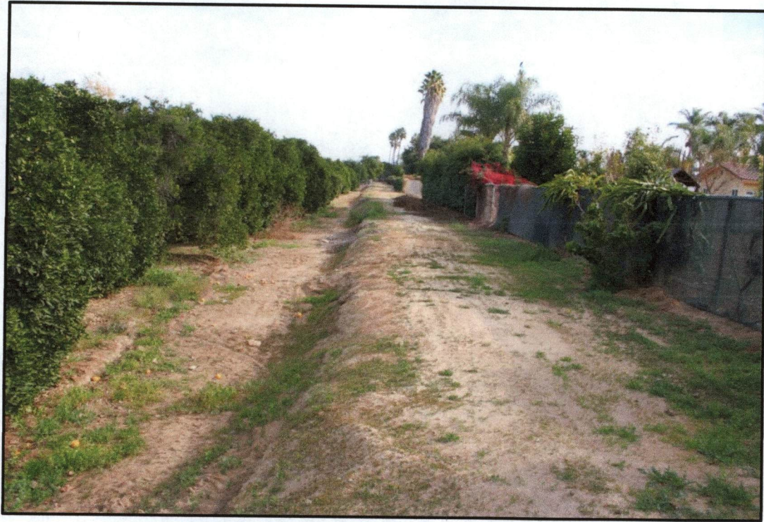
Southeastern edge of the project area (Northeast)