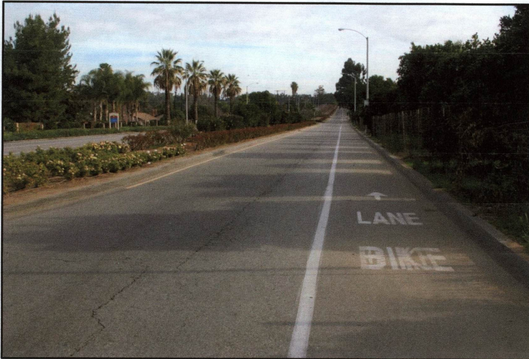
Victoria Ave corridor from La Sierra Ave (subject property on right); note absence of sidewalk; Northeast)