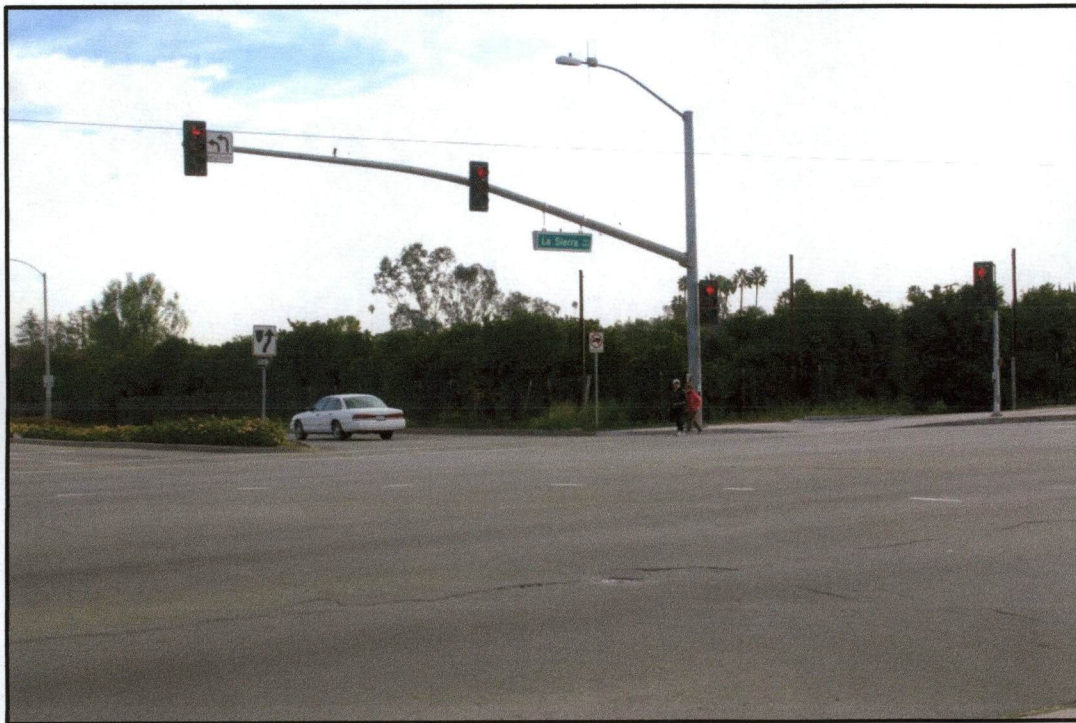
Intersection of Victoria and La Sierra, Riverside (western corner of the project area; subject property in background; East)