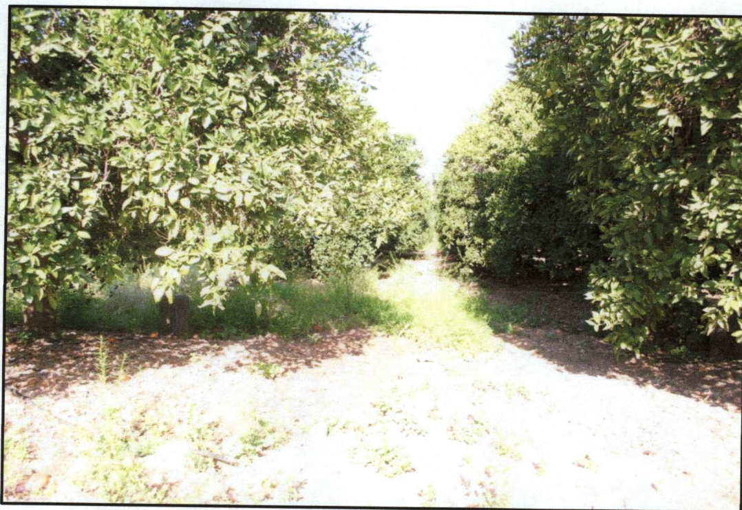
Typical tractor row in orchard with minimal clearance and reduced ground visibility (Northwest)