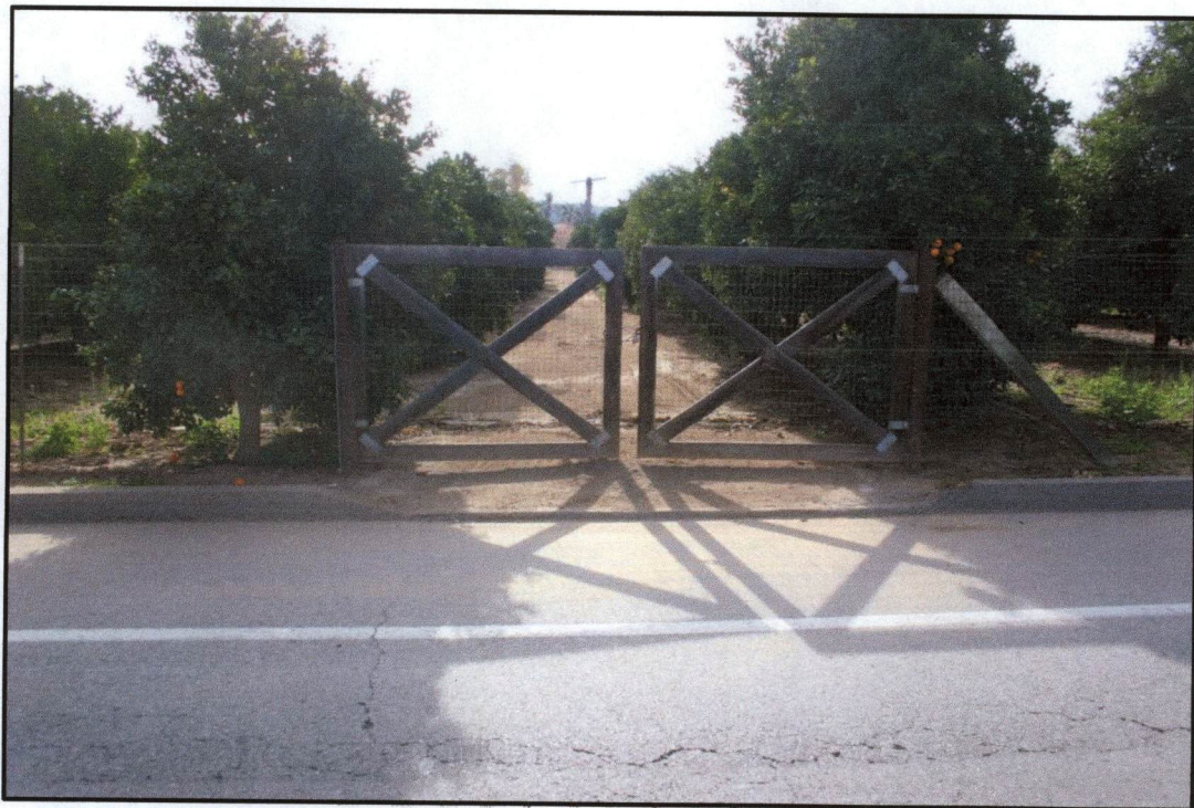
Utility gate to subject property on Victoria Ave (locked); note wind propeller in background (Southeast)