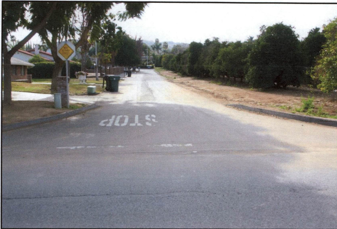
Millsweet Place corridor from Victoria Avenue (subject property on right; Southeast)