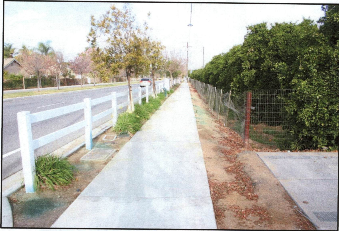
Sidewalk easement between La Sierra and the project area (subject property on right; Northwest)