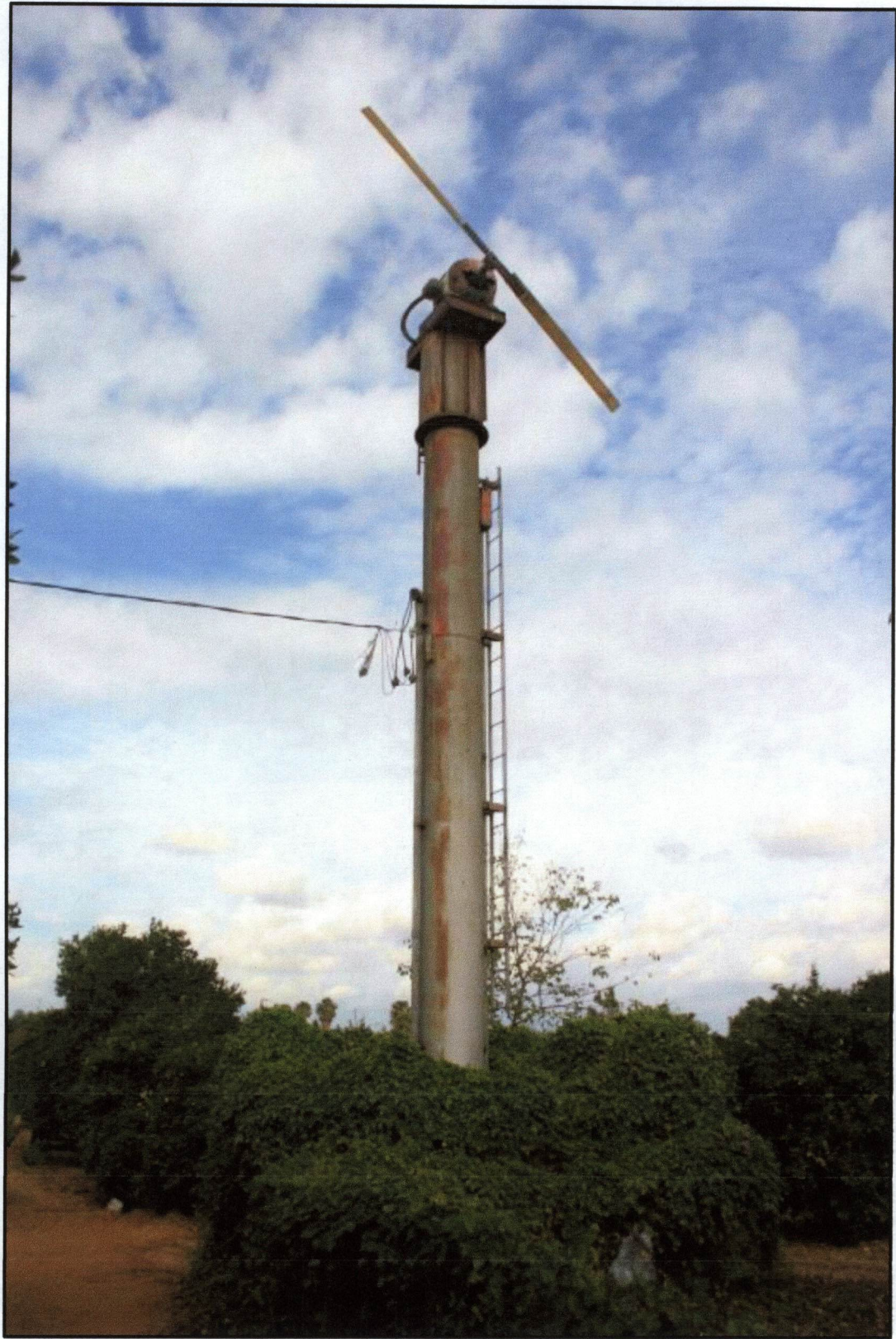
Solitary wind machine near center of property (North)