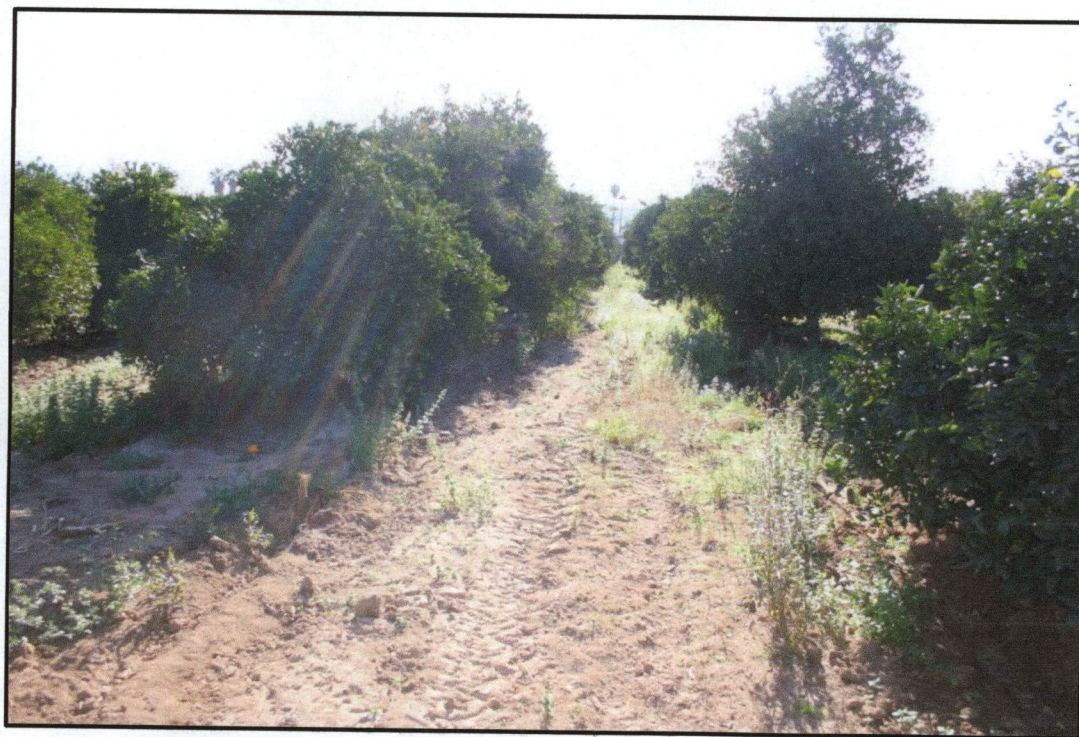
Typical tractor row in orchard with more clearance and better ground visibility (Southeast)