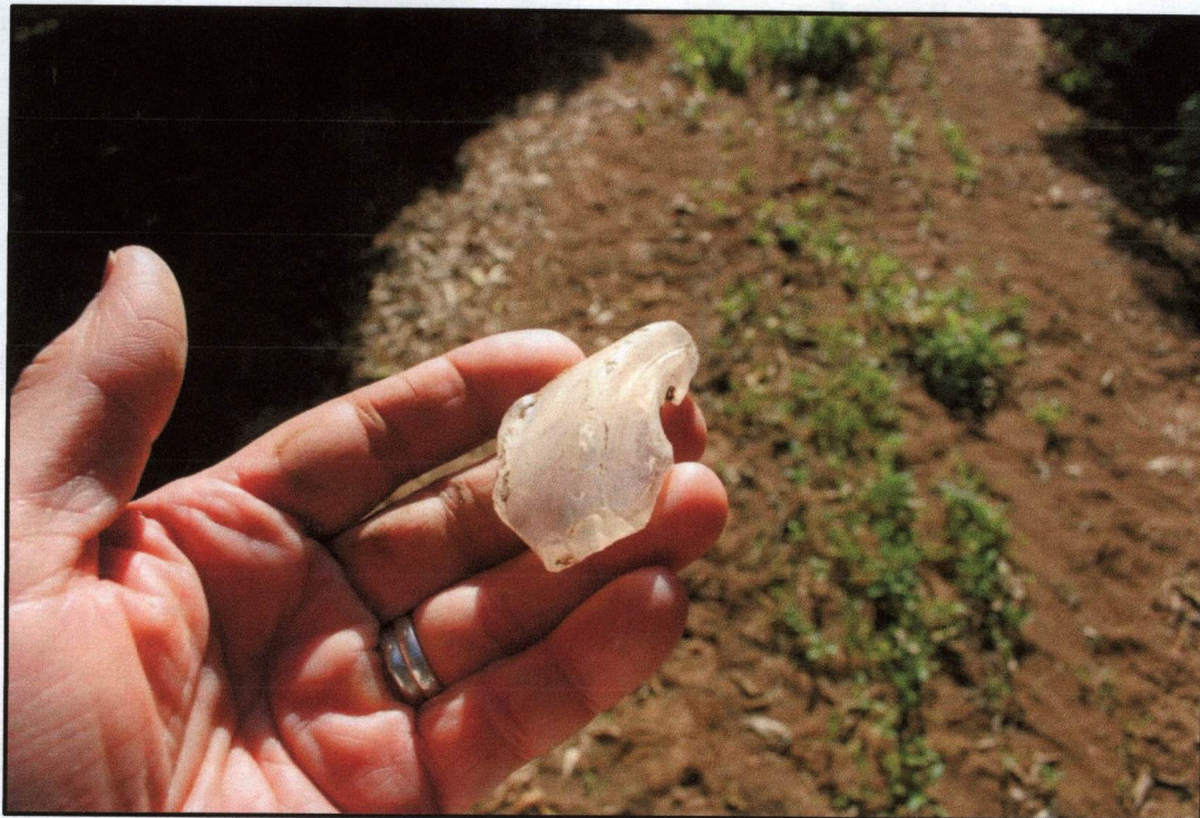
Non-stippled bottle base fragment in orchard (Detail)