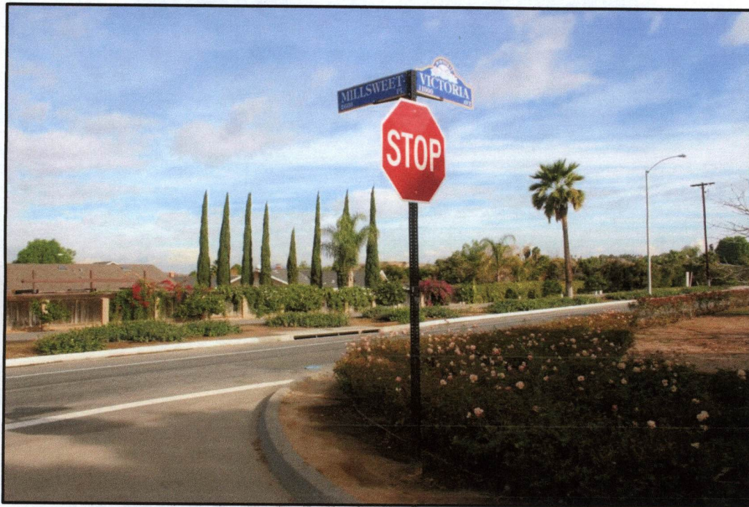
Signage for Victoria Ave and Millsweet Place near northern corner of the subject property (North)