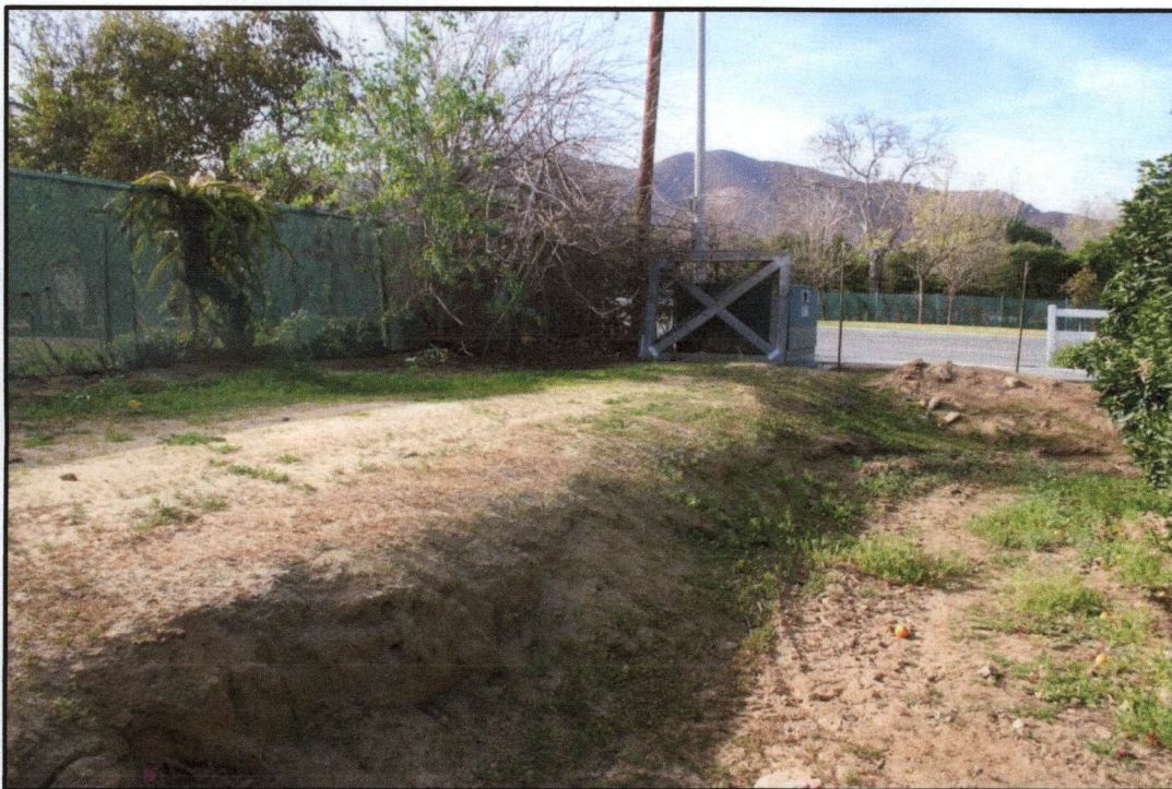
Southern corner of project area from within the property (lower grade is a slope cut, apparently to help level the orchard and reduce runoff; Southwest)