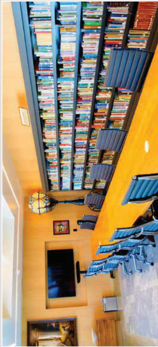
Carnegie Reading Room

In an interior, large, whimsical space, the Storytime Area invites reading and learning together in cheery comfort.