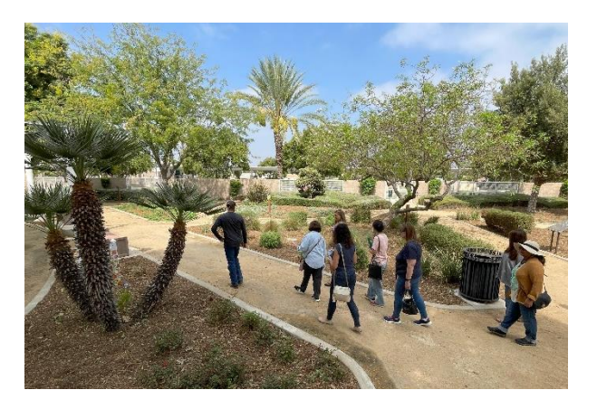
About 20 customers attended the Sept. 14 waterwise landscaping workshop held at the Kathleen M. Gonzalez Memorial Garden adjacent to the Casa Blanca Library.