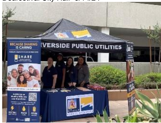
Waterwise Workshop, Casa Blanca Library- 9/14/24