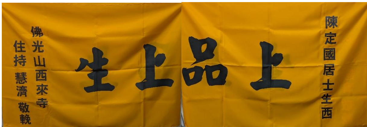
Buddhist memorial scroll