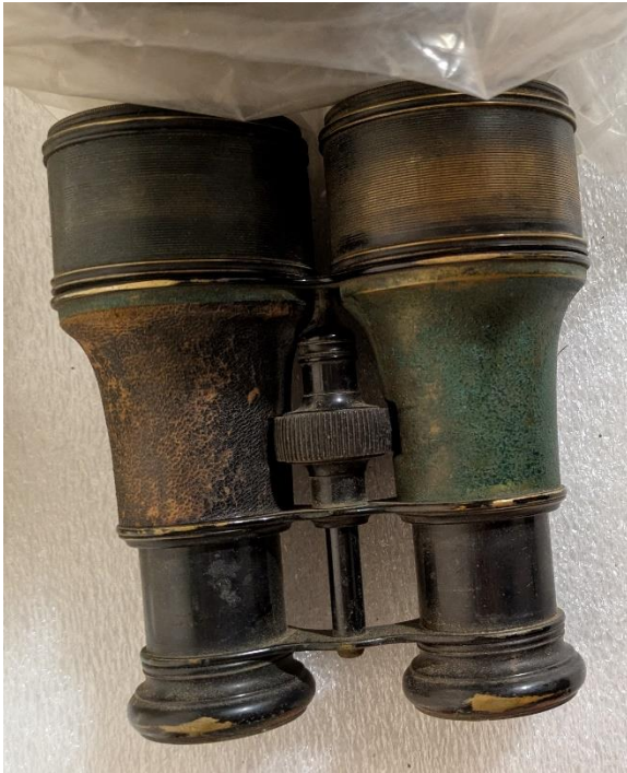
Binoculars (late 19 th to early 20 th century)