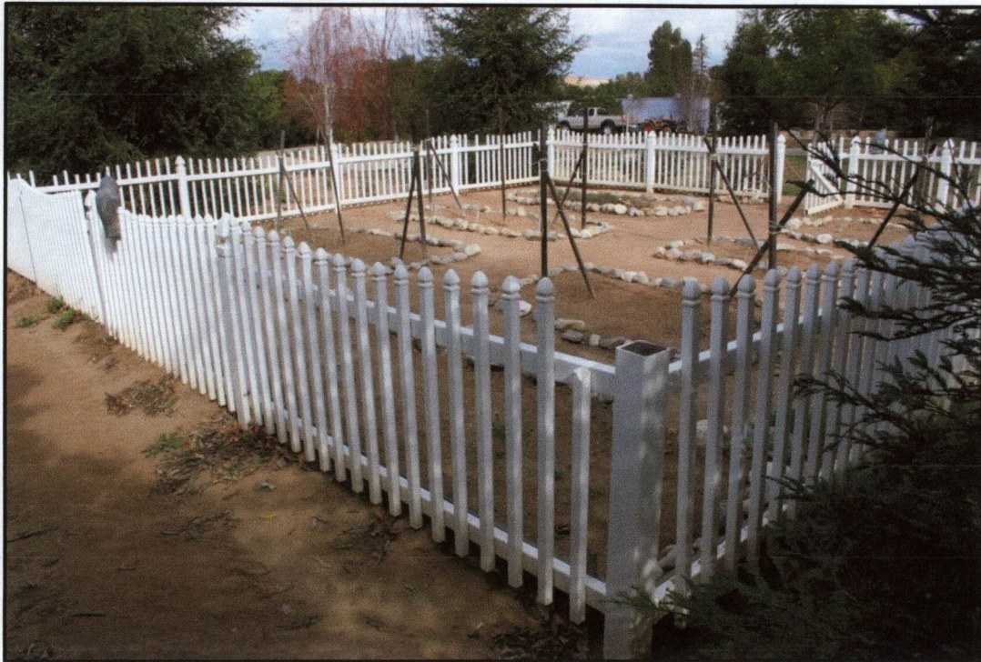
Interior view of "community garden" showing unplanted rock-lined vegetable beds (North)