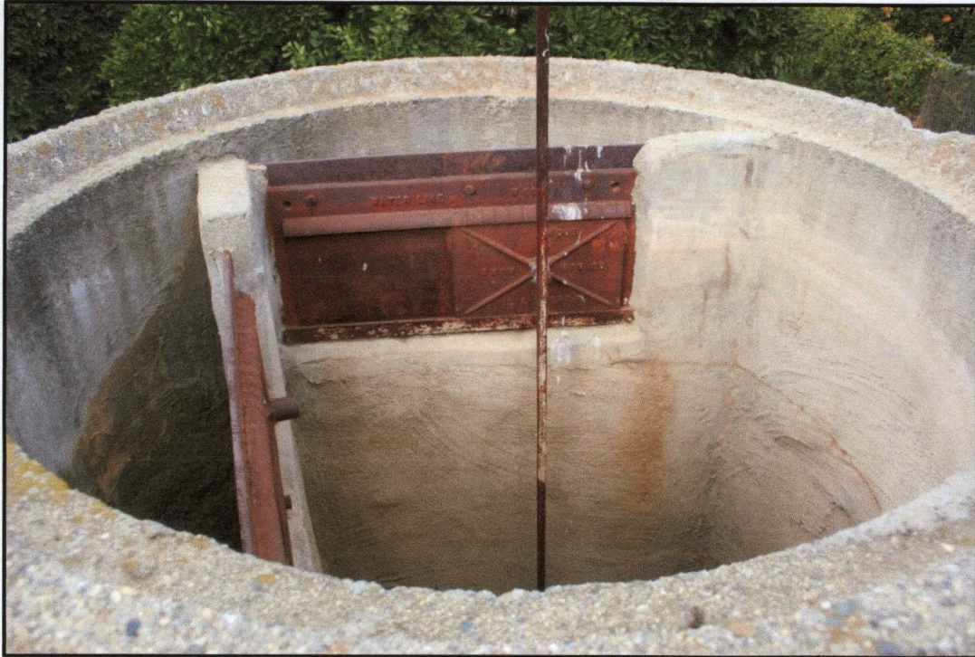
Interior of large standpipe feature (see previous photo; Close-up)