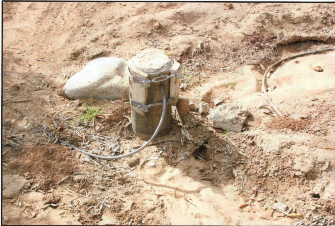
Another example of standpipe irrigation head (Close-up)