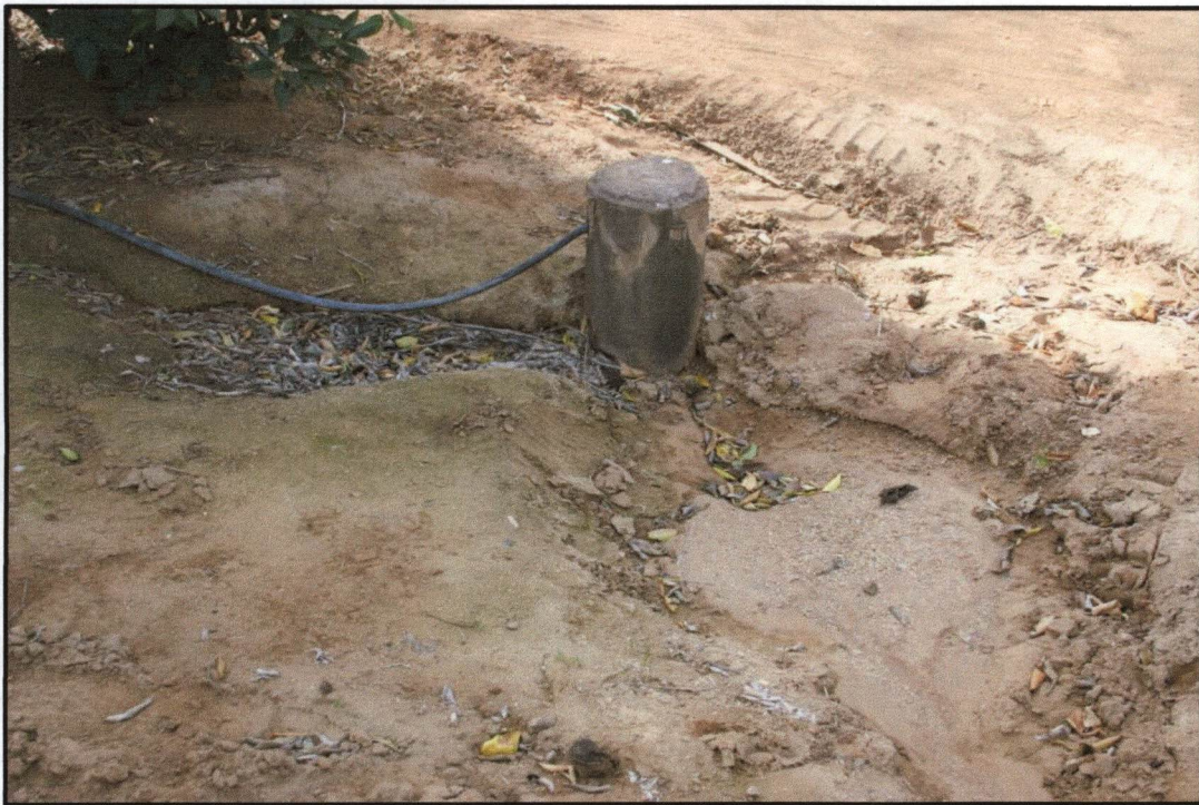
Example of low-profile standpipe irrigation head; these are placed along South-eastern (upslope) edge of the orchard and across the middle (Close-up)