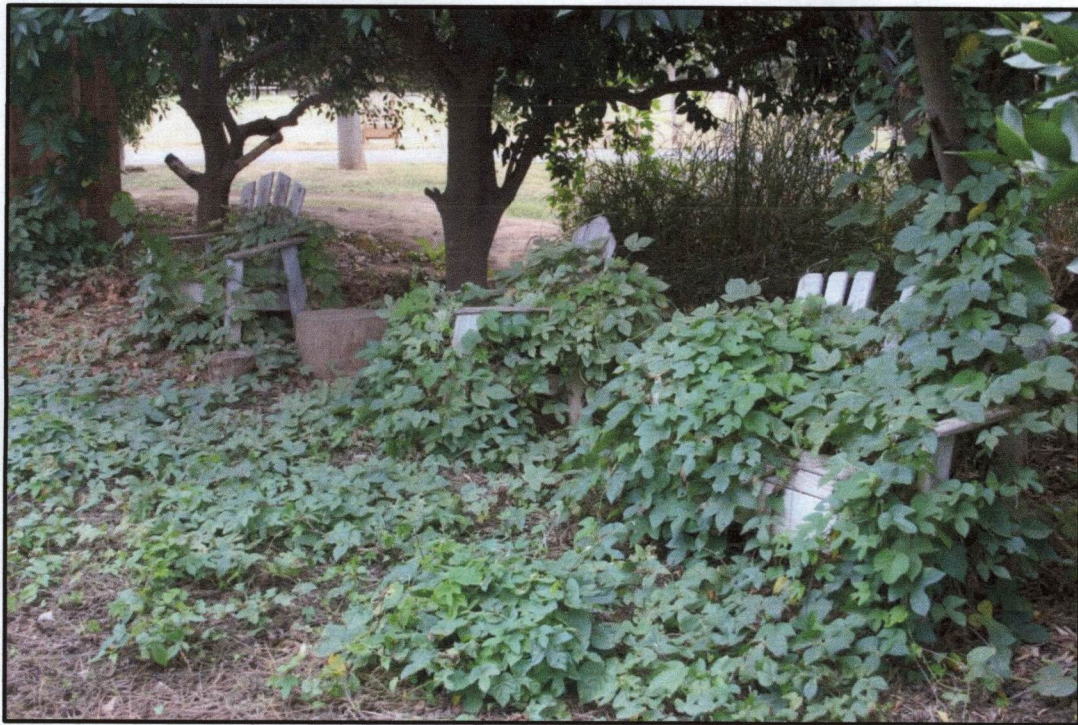
Shady sitting area behind the storage features, disused and heavily overgrown (South)