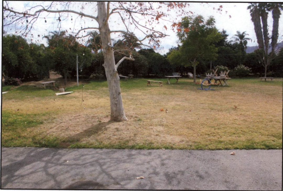
Overview of picnic area at eastern end of "park" (South)