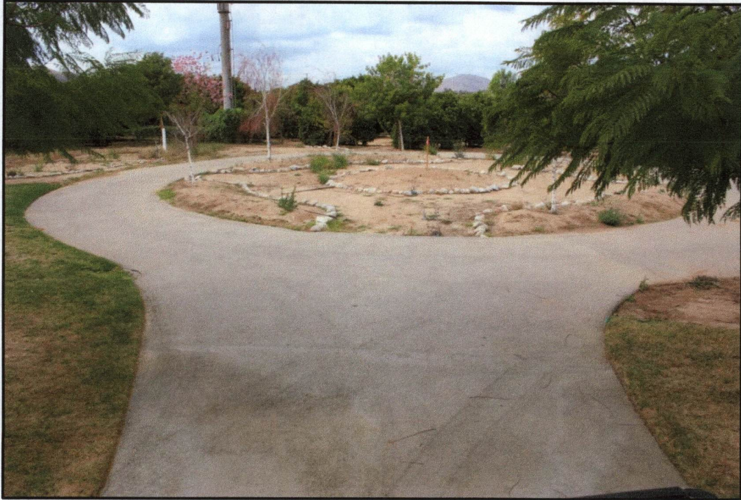
Overview of the looping driveway (West/Northwest)