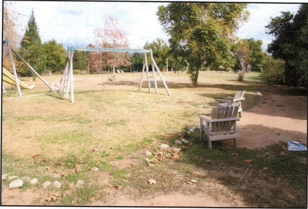
Similar view of the "park" (Northeast)