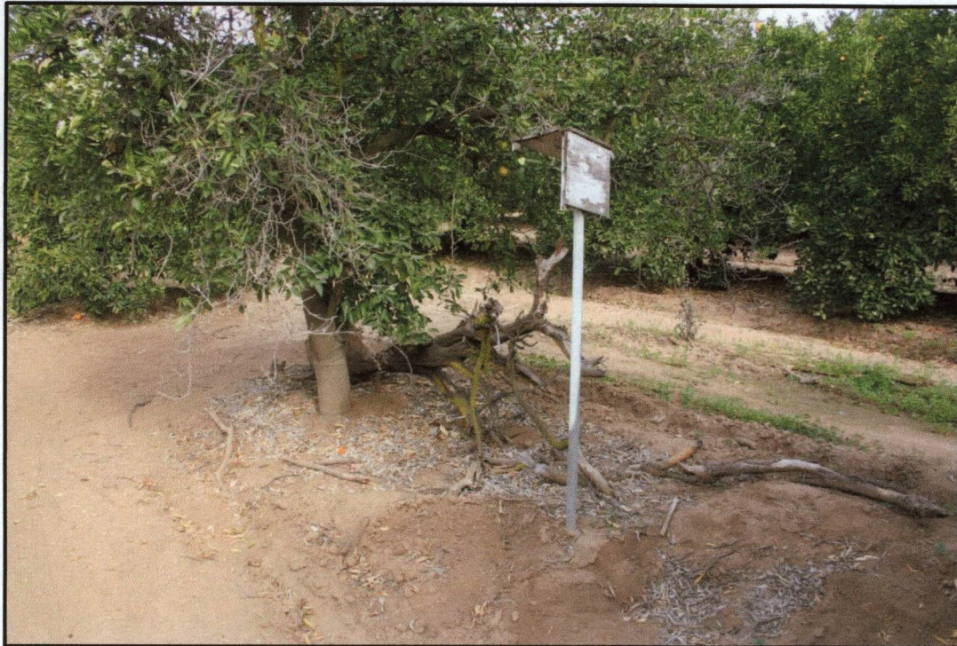
Orchard-related feature on metal post (Close-up)