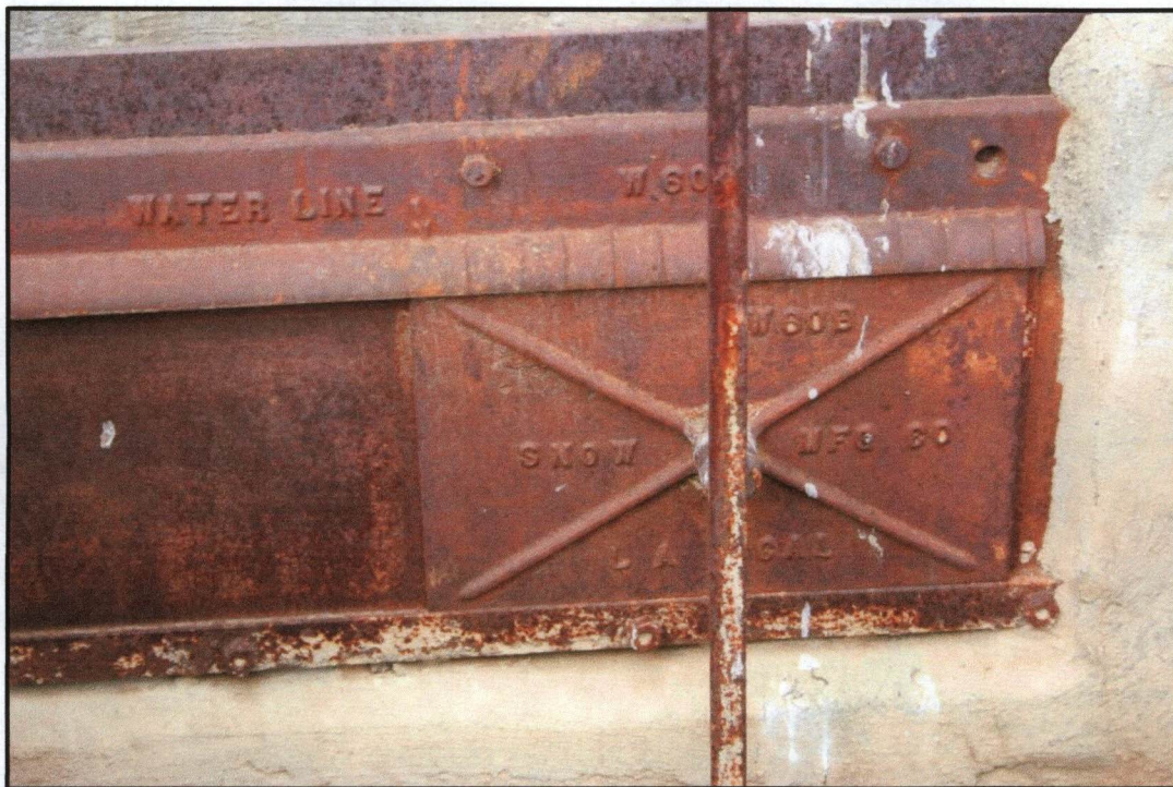
Gate valves within the large standpipe feature (Detail)