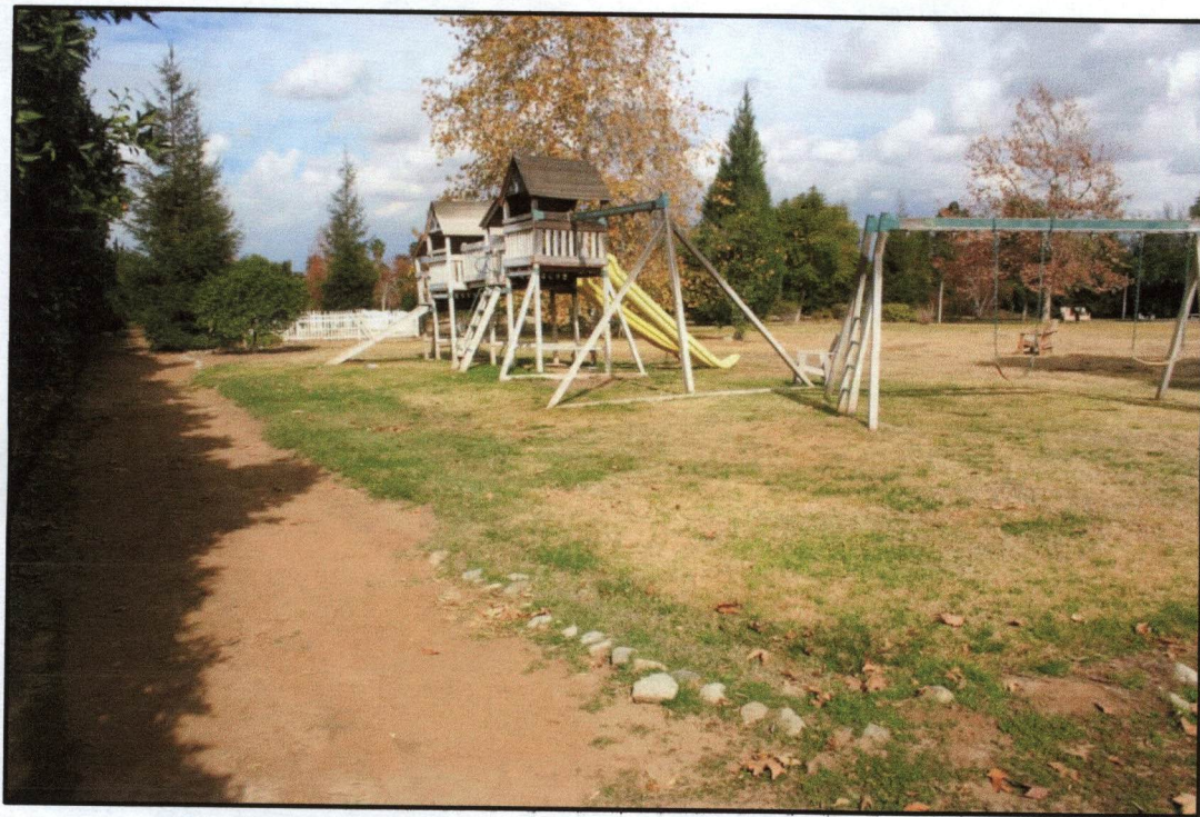
Children play area, western end of grassy "park" (North)