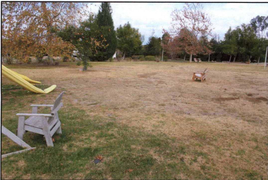
Similar overview of the grassy "park" area (North)