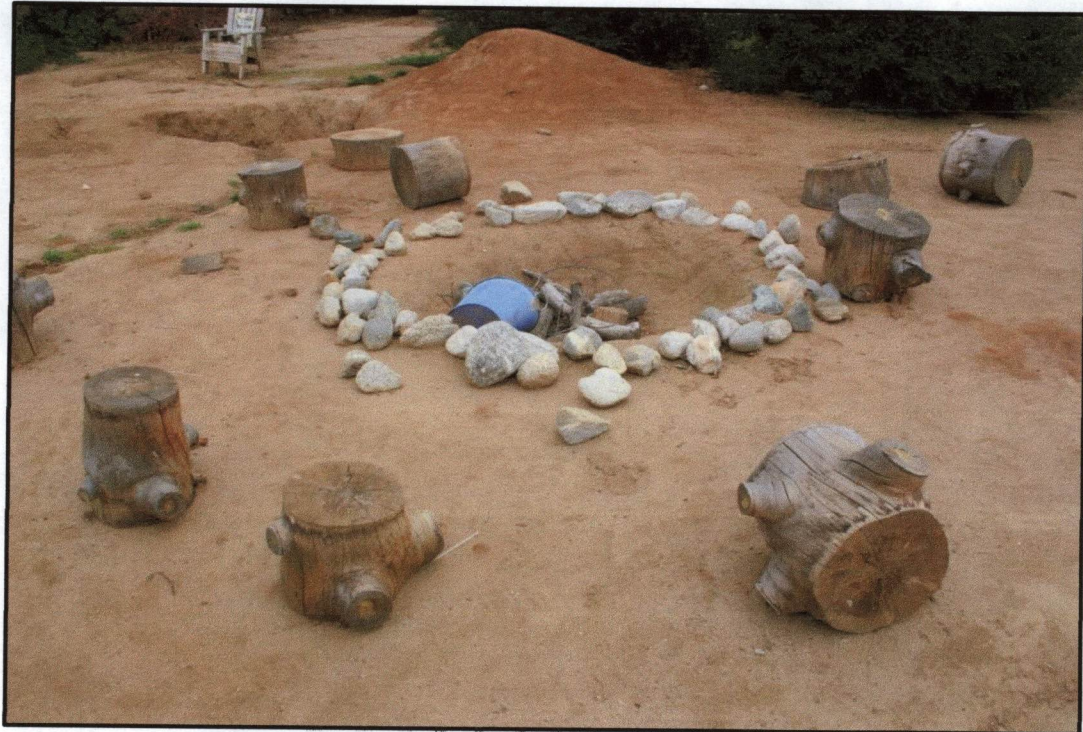
Apparent fire pit area near the loop, unused (East)