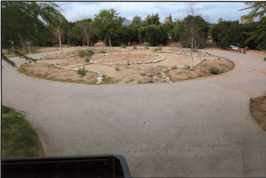
Overview of the looping driveway (West/Northwest)