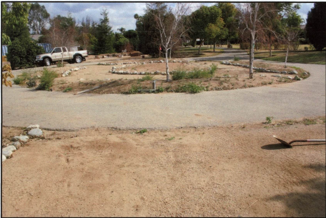
Narrow looping driveway between orchard and the "park" (grassy family recreation area; East)