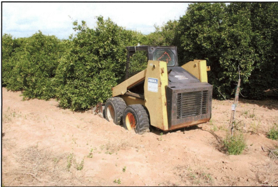
Modern-era farm equipment in the orchard (North)