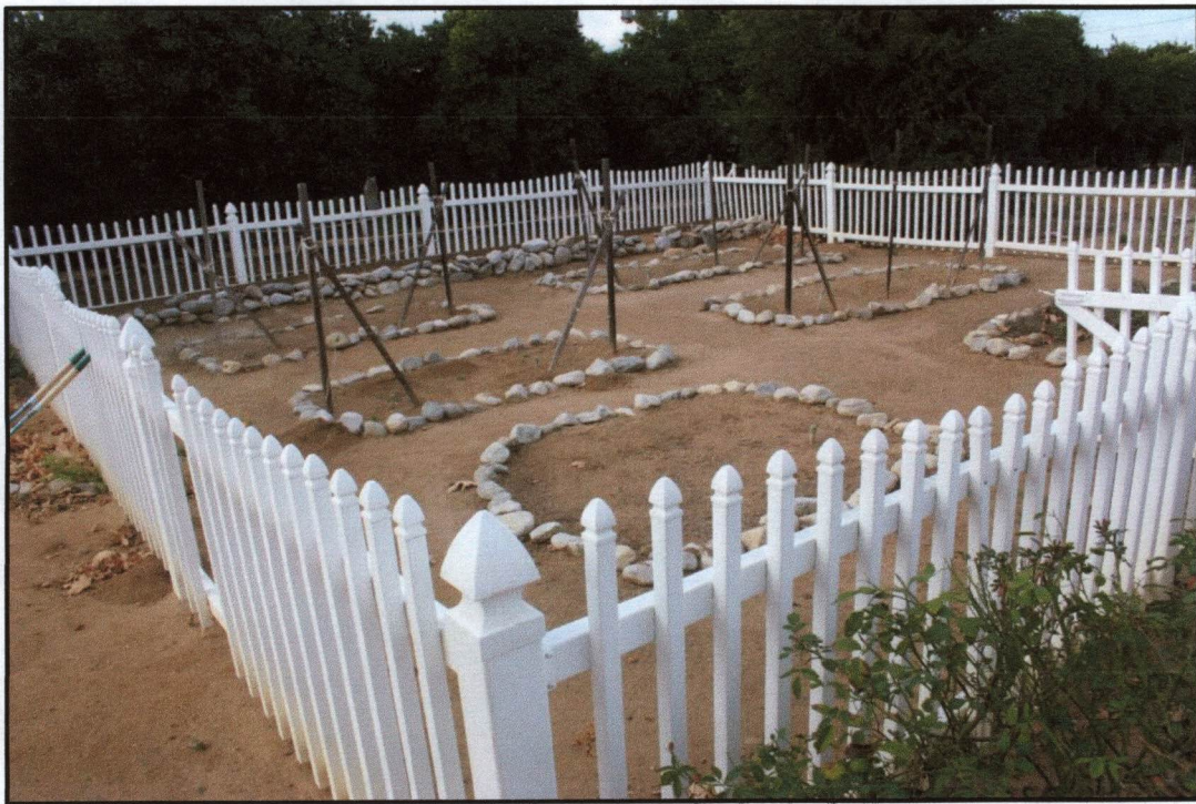
Similar view as shown in Photo 022 (picket fence is modern PVC material, not wood; West)