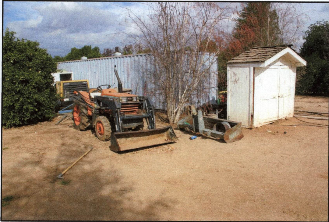
Modern-era farm equipment and storage features adjacent to the looping driveway (North)