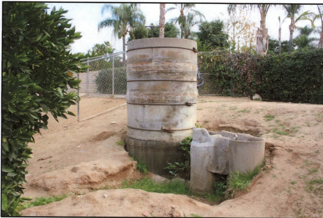
Large standpipe irrigation feature in eastern corner of the property (East)