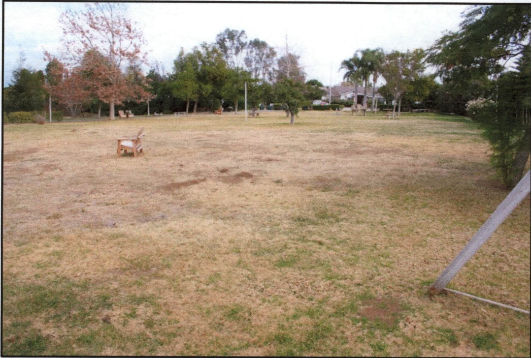
Overview, central area of the grassy "park" (Northeast)