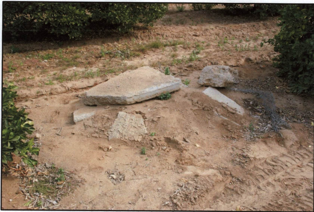
Concrete debris in orchard (platform fragments; Close-up)