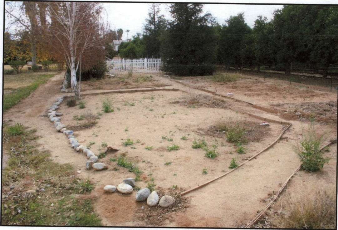
Unfenced garden plots adjacent to "community garden" are also unplanted (Southeast)