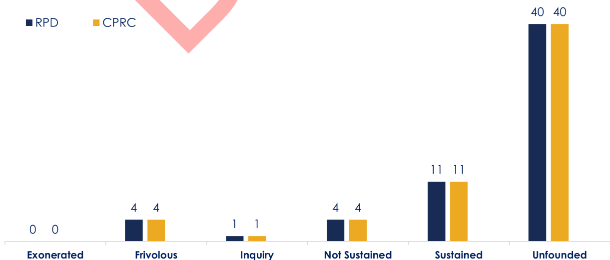
Figure 3 provides data comparing the complaint case findings of the 60 allegations reviewed by the Riverside Police Department (RPD) and Community Police Review Commission (CPRC). Each of the entities independently reach findings on allegations.

Frivolous: Complaints that are totally and completely without merit, or which are made for the sole purpose of harassing a police employee may be classified with a finding of Frivolous as approved by the Internal Affairs Lieutenant or a chief officer.