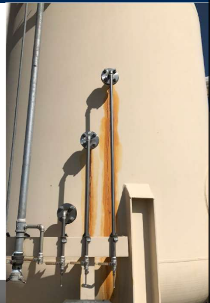
Vessel N from the outside with leaks (right)