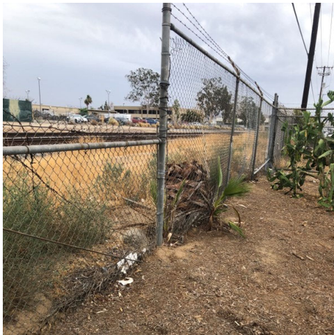
FENCING AT MOTOR CIRCLE