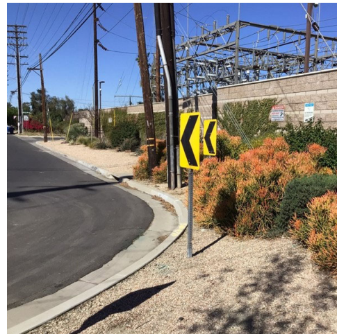
MOUNTAIN VIEW AVENUE SIDEWALK