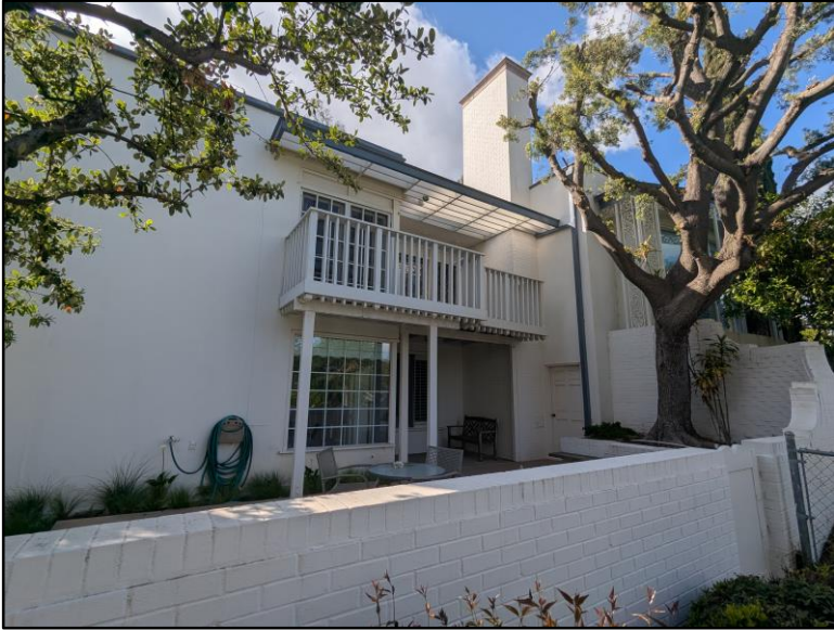
East (rear) Elevation