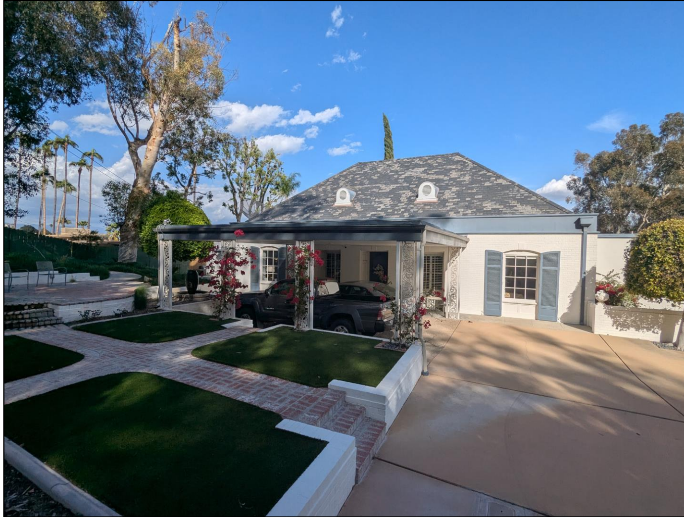
Current building façade