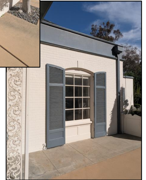
Hollywood Regency Decorative Features