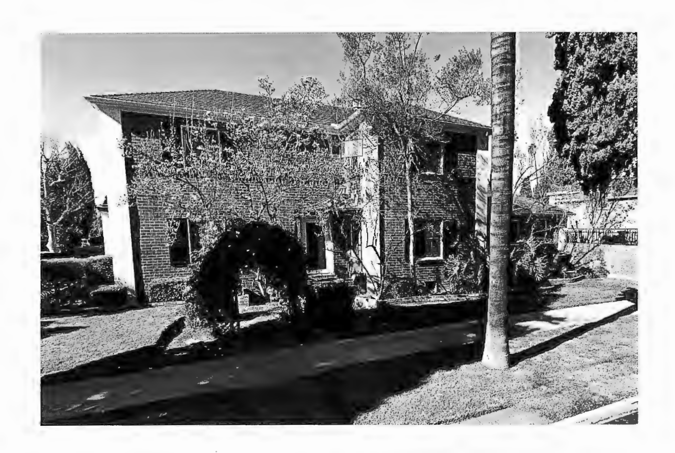
Exhibit "C" 3609 Castle Reagh Place