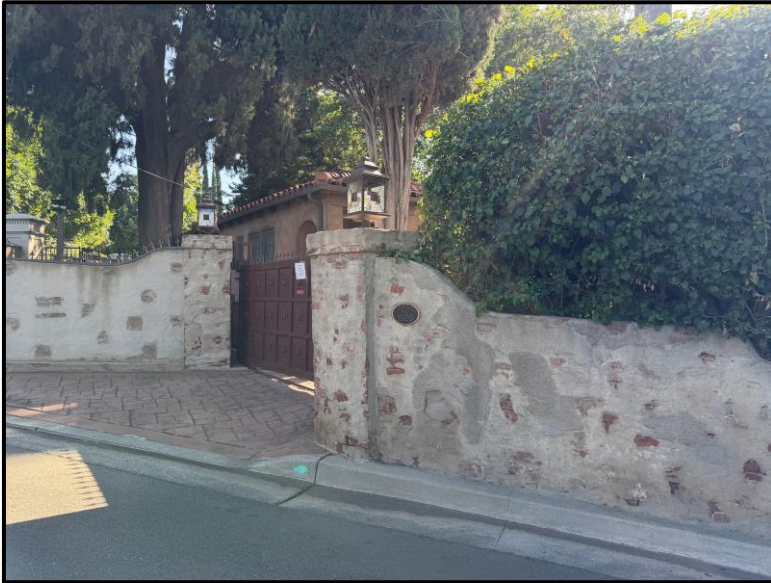
Perimeter wall and gate house