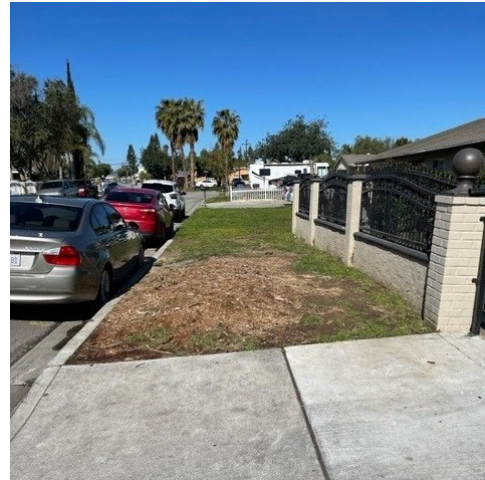
LESSIE LANE (SIDEWALK)