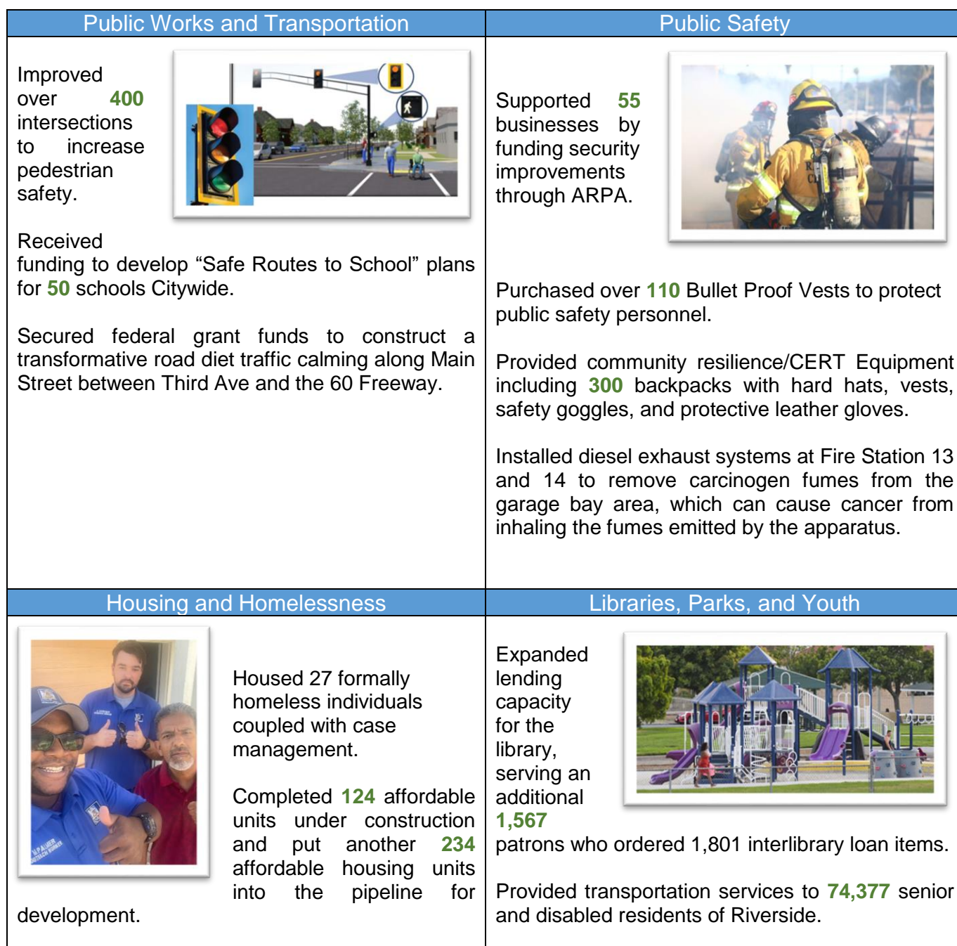
Table 2. - Impact of Grant funds on Riverside Residents

Grant funded programs have real impacts for city residents. Highlights are included in the chart below.