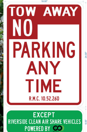
Existing location Signs