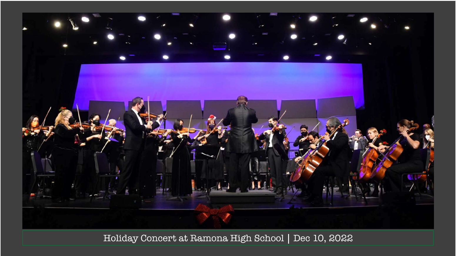
Holiday Concert at Ramona High School | Dec 10, 2022